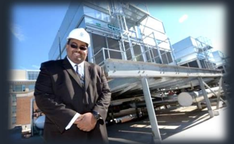
Cooling Tower Replacements, Philadelphia