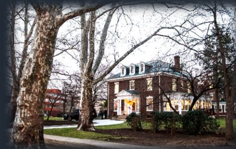
Corporate Headquarters, Philadelphia Navy Yard