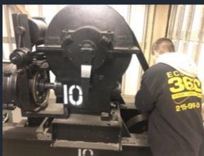
Vertical Transportation Pulley Maintenance

ECSI360 ensures that its clients vertical transportation systems are always available. Our company was the auditor for the central plant and vertical transportation systems for the two million square foot Pennsylvania Convention Center. During that time our firm provided recommendations that saved millions of dollars in costs and protected revenue by ensuring that the two main escalators in the building were properly maintained. Our technicians have all of the needed certification and training to ensure that clients are protected 24/7 throughout the mid-atlantic region. Our work order technology and asset management solutions provide predictive maintenance that resolves issues before they become a major emergency.