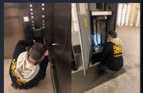
Elevator Electrical and Wiring Maintenance